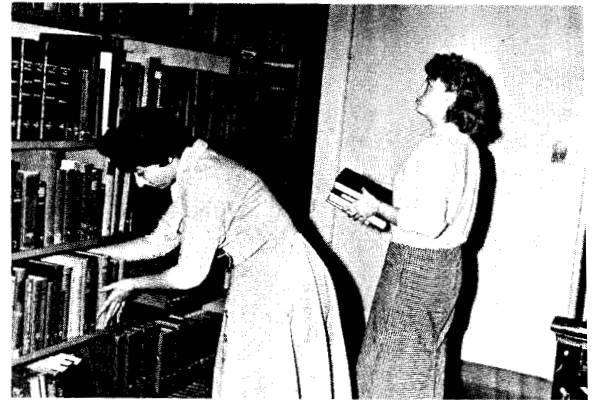
Our library science class maintains order by cataloging, repairing and shelving new and returned books.

FIVE THOUSAND copies of printed as you read these words. you a