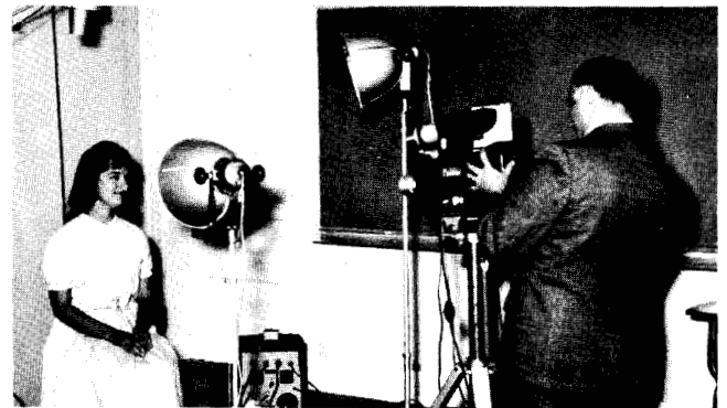
An early step in the production of the 1963 Envoy; the posing and taking of student portraits.