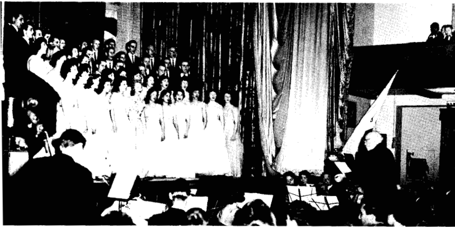
The sixty voices of the Ambassador Chorale fill the auditorium with the classic song, BATTLE HYMN OF THE REPUBLIC.