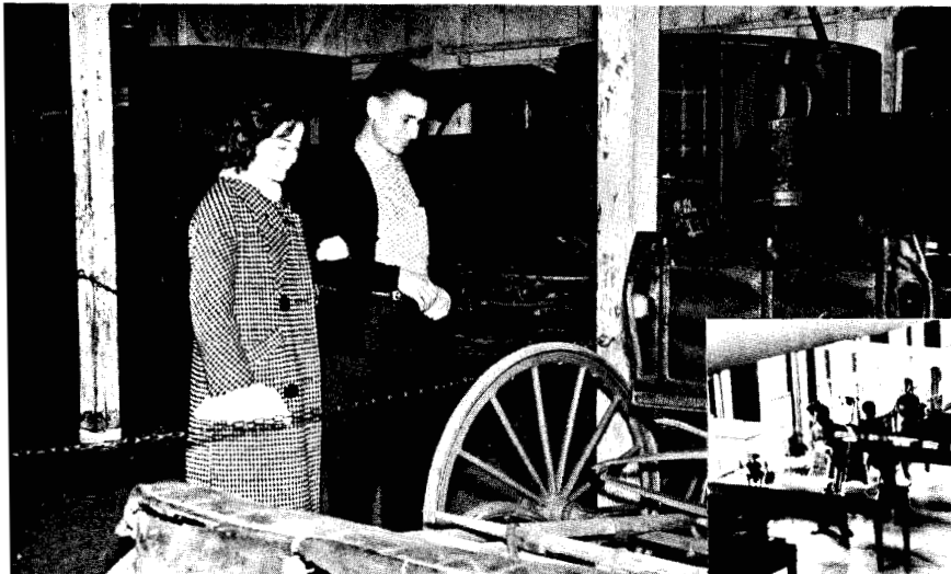
A visit to Knott's Berry Farm provides an excellent opportunity for contrasting relics of the OLD WEST with our modern day transportation.