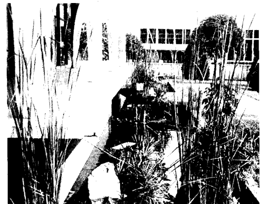
East side of CCC Building where our office entrance is located.